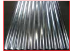
Galvanised Steel Sheets