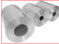
Aluzinc Coated Steel