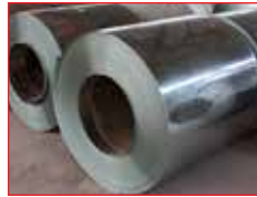
Galvanised Steel Coils