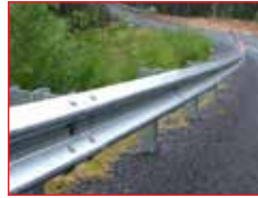
Metal Beam Crash Barriers